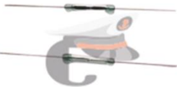
OKI REED SWITCH