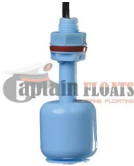
PP FLOAT SWITCH SENSOR LIQUID LEVEL CONTROLLER