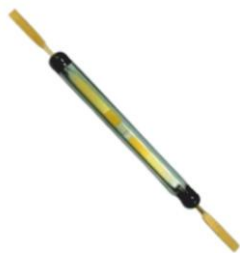
1523 SPST REED SWITCH

Production Capacity: 10K-50K Delivery Time: 08- 10 WEEKS Packaging Details: 2000 BOX