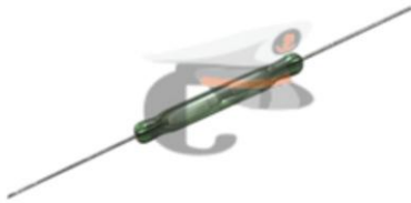
COTO REED SWITCH