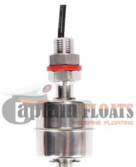
SINGLE FLOATING BALL SS FLOAT LEVEL SWITCH