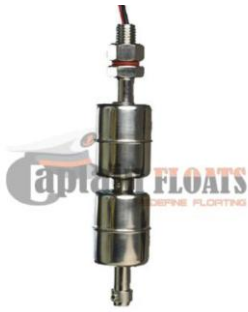
DOUBLE FLOATING BALLS SS FLOAT LEVEL SWITCH