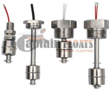
FACTORY SALE 304 SS FLOAT LEVEL SWITCH SENSOR