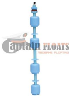
FACTORY DIRECT SALE FLOAT LEVEL SWITCH SENSOR