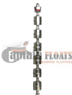
MULTI-POINTS STAINLESS STEEL FLOAT LEVEL SWITCH SENSOR