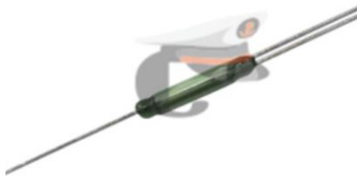
COTO REED SWITCH

Production Capacity: 10K-50K Delivery Time: 08- 10 WEEKS Packaging Details: 1000 BOX