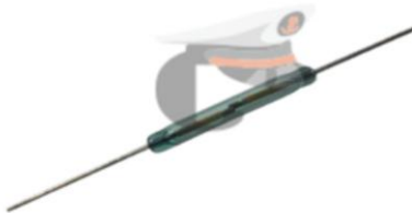
OKI REED SWITCH BRAND : KOFU