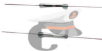
OKI REED SWITCH BRAND : KOFU

Production Capacity: 10K-50K Delivery Time: 08- 10 WEEKS Packaging Details: 1000 BOX