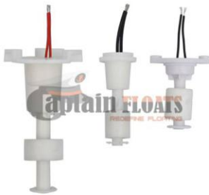
VERTICAL PLASTIC FLOAT LEVEL SWITCH SENSOR