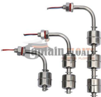
SIDE MOUNTED STAINLESS STEEL FLOAT LEVEL SWITCH