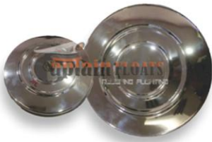
STAINLESS STEEL DISH FLOAT Float & Board Type Level Indicator

We provide high-quality Stainless Steel Dish Float (Thali Float), the perfect solution for your float and board type level indicator needs. Our Stainless Steel Dish floats in guided product range provides enhanced stability and accuracy, while Captain Float's Stainless Steel Dish Float in non-guided product range offer versatility and cost-effectiveness.